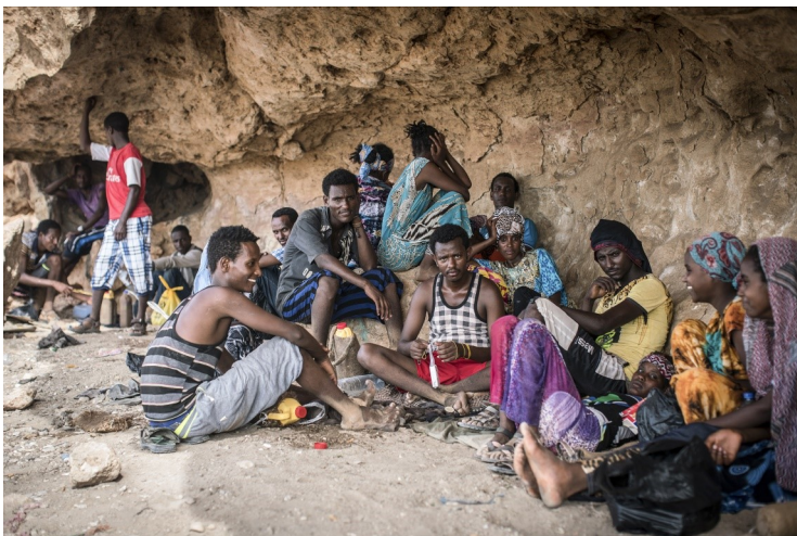
Migrants waiting for boats to take them to Yemen from Somalia.

Policy : On 15 th May 2018, the Security Council voted in favour of extending the African Union Mission in Somalia until the end of July 2018. The Council also recalled its earlier decision to authorize the AU reduce the number of uniformed personnel and requested the UN Secretary-General to continue logistical support for AMISOM, the Somalia National Army operating with AMISOM and UN Assistance Mission in Somalia (UNSOM).