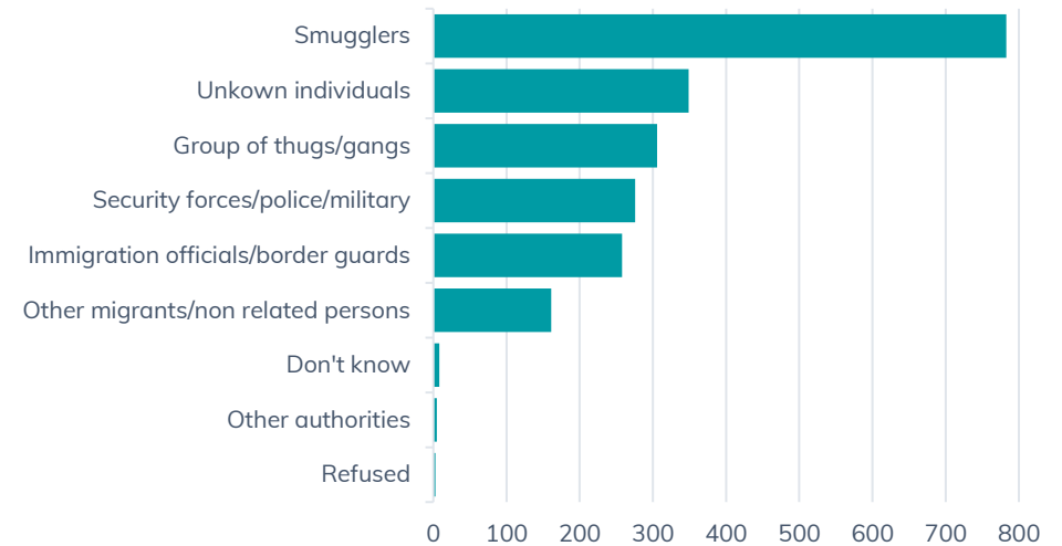
Figure 6. Perpetrators of physical abuse

4Mi data indicates that smugglers were considered the main perpetrators of all forms of abuse against migrants and refugees. Other groups, such as thugs/criminal gangs and security forces, were identified to a lesser extent. Among 972 cases of physical abuse, for example, 81% were reportedly committed by smugglers, 36% by unknown individuals, 31% by thugs/criminal gangs and 28% by security forces (respondents can report more than one perpetrators). Among 746 cases of robbery, 68% were reportedly committed by smugglers, compared with 61% by groups of thugs/criminal gangs and 40% by single unknown individuals.