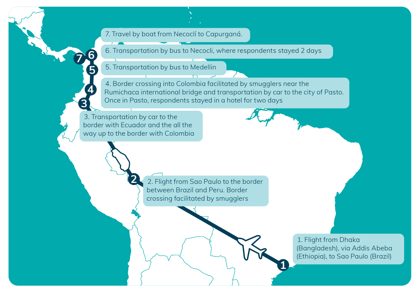
Figure 2. Journey across South America for Bangladeshi respondents