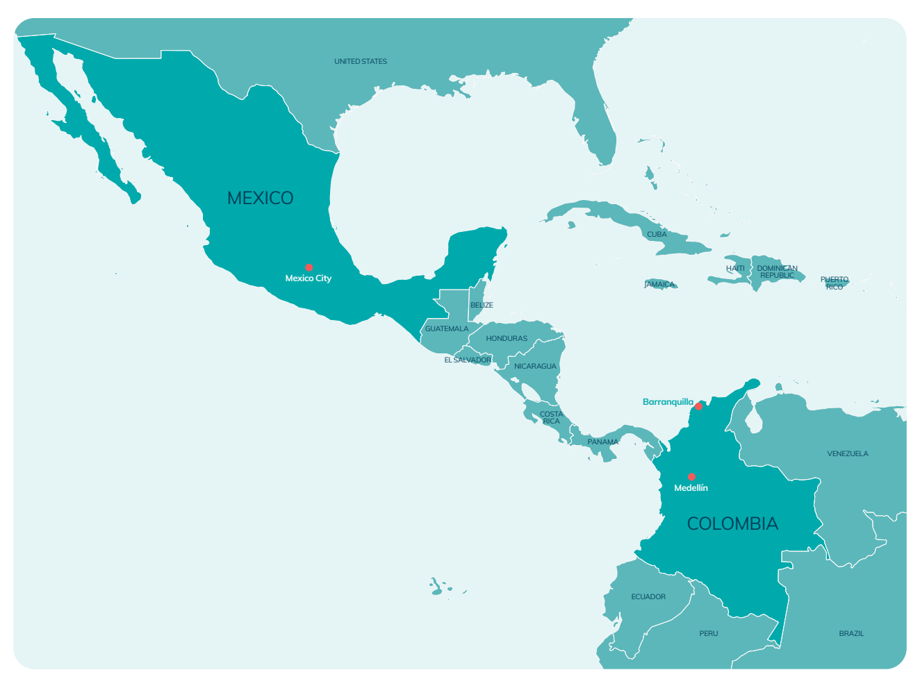
Figure 2. 4Mi Cities project locations

4Mi Cities aims to build evidence to better inform local responses to mixed migration in cities and create a strong case for national and international legal, fiscal and policy frameworks that enable cities to adequately provide necessary services to refugee and migrant populations. The data collected will be used by city governments involved in the project, as well as humanitarian and development actors, to improve their current migration policies and responses at city level.