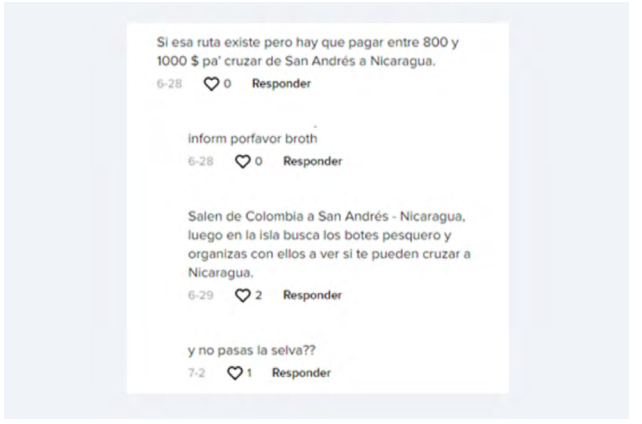
Image 5: "Yes! This route exists, but you must pay between 800 and 1000$ to cross from San Andres to Nicaragua." 2. "Information, please." 3. "You leave from Colombia to San Andres - Nicaragua. On the island, look for fishing boats and organize with them to see if they can cross to Nicaragua." 4. "And you don't have to cross through the jungle?" (Editor's note: Reference to the Darien Gap)