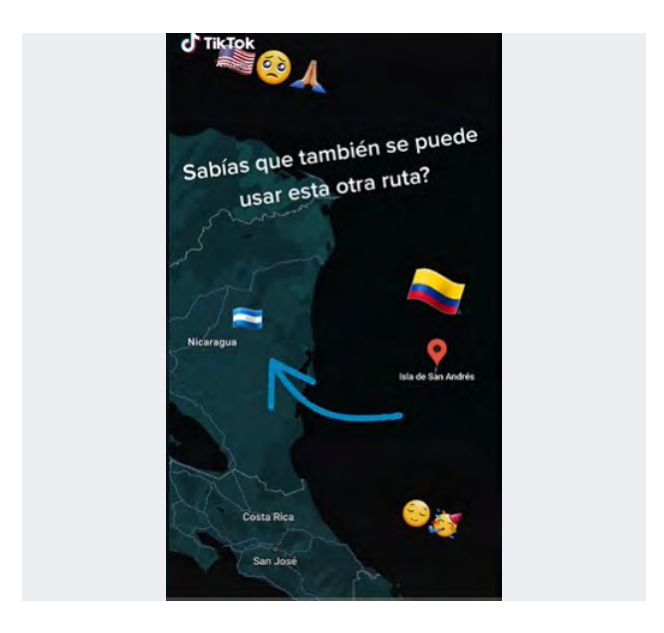
Image 3 published 17 of July: "Route confirmed, NOT to cross the Darien jungle. San Andres Island - Direct boat trip to Nicaragua."