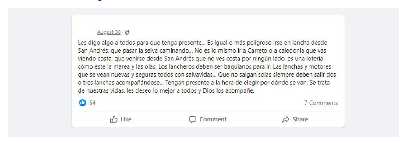
Image 7: "I will say something to all of you to keep in mind. It is equally or more dangerous to go by boat from San Andrés than to walk through the Darien jungle. It is not the same to go to Carreto or Caledonia (Editor's note: Darien Gap route), where you will see the coast, as going from San Andrés, where you do not see the coast anywhere, is a lottery of how the weather and the waves are. The fishers must be experts to go. The boats and motors must look new and safe, all with life jackets. Do not go out alone;